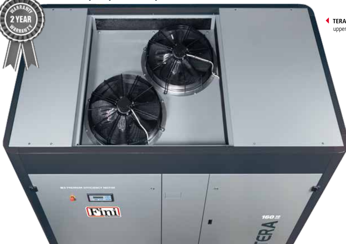
◀ TERA 110 - 132 - 160 upper view