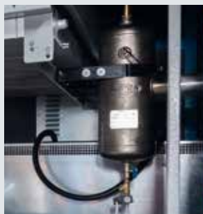
Condensate separator with automatic drain.